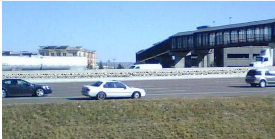
FIGURE 3: MICRO-TURBINES DEPICTED AT INTERSTATE 25 AND DRY CREEK IN DENVER, CO