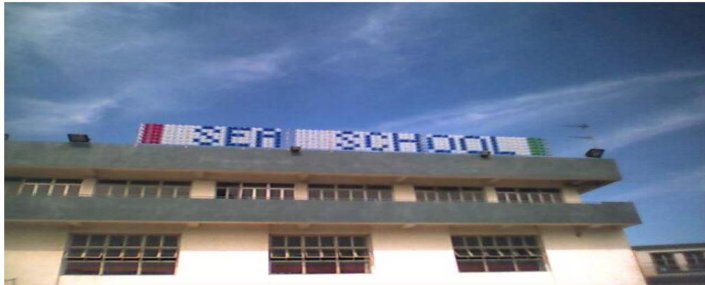
FIGURE 2: COMMERCIAL DEMONSTRATION OF MICRO-WIND TURBINES AT THE HONG KONG SEA SCHOOL 43