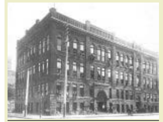
Haish Building—14th & Arapahoe St