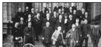
First Class of the Law School

We invite you to browse our website and enjoy this glimpse into the past and present of the College of Law. Most of the material presented here has been collected from law school sources or the University archives in the Penrose Library. To submit ideas or additional photos, please contact me at pwellinger@law.du.edu or 303-871-6479.