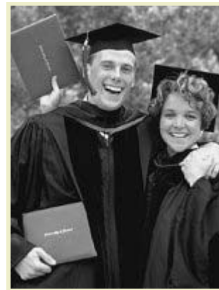
Happy Law Grads!

http://www.law.du.edu/library/colhistory