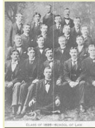
Class of 1895